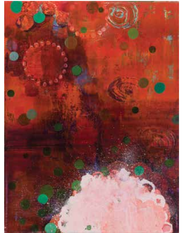
Claret , 2014, oil on linen, 16 by 12 inches