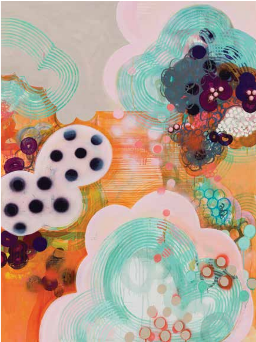
Rapture , 2014, oil, polymer resin, paper balls, and spray paint on linen, 48 by 36 inches (opposite page) Studio wall with nineteen paintings

world. She reflected on the transition in her work: “I started moving away from the more naturalistic, or even ‘Old World’ color palette in the mid-’90s. At the same time, I began experimenting with a wider range of materials and methods of both applying and removing paint.”