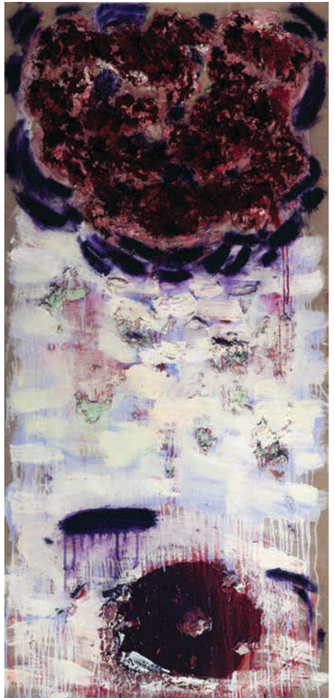
Winter Rose , 2013, oil, acrylic, papier-mâché, pastel, and glitter on linen, 64 by 30 inches