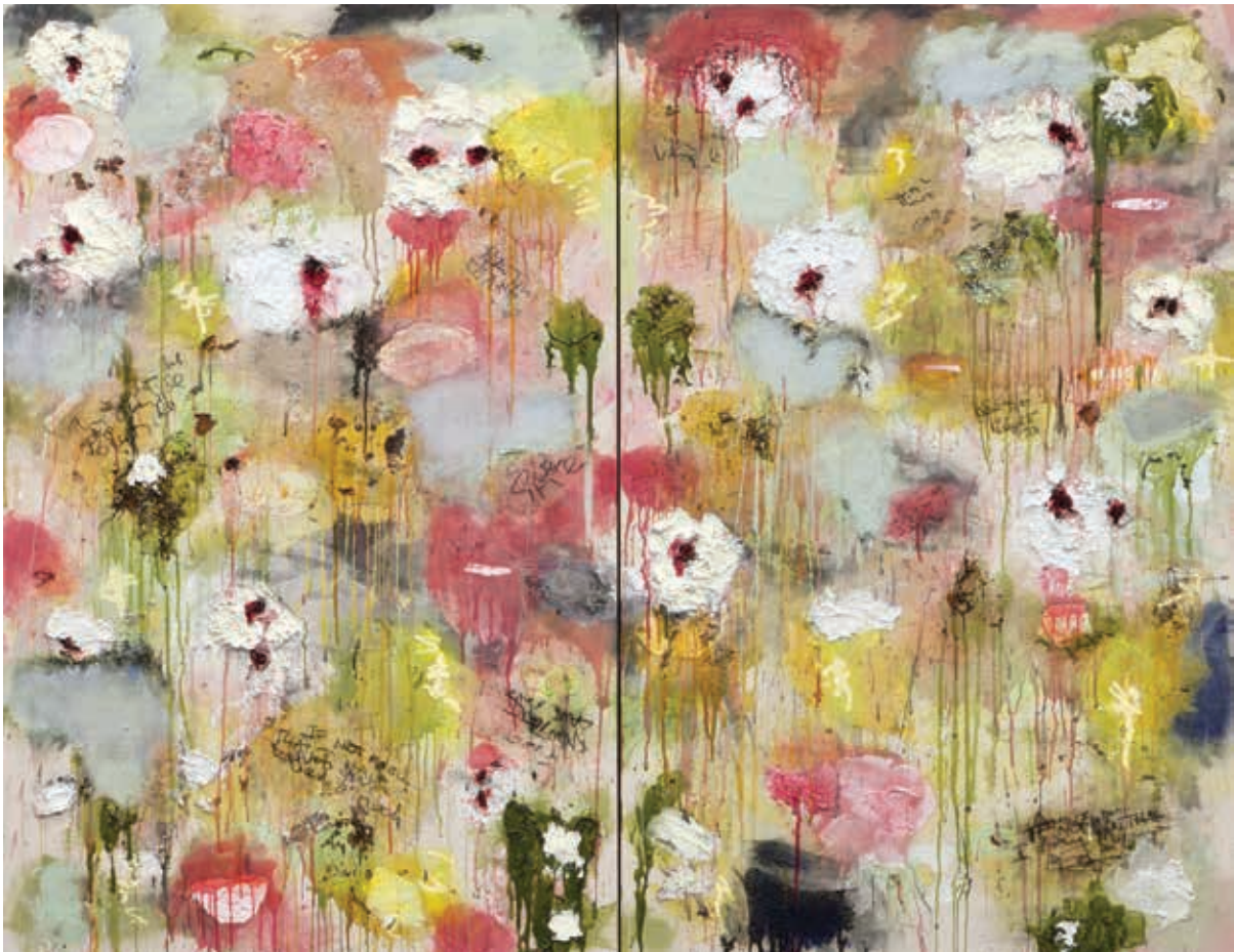
Amor Matris , 2015, oil, acrylic, papier-mâché, paper, etching fragments, rosebuds, twigs, and glitter on canvas, 66 by 84.5 inches