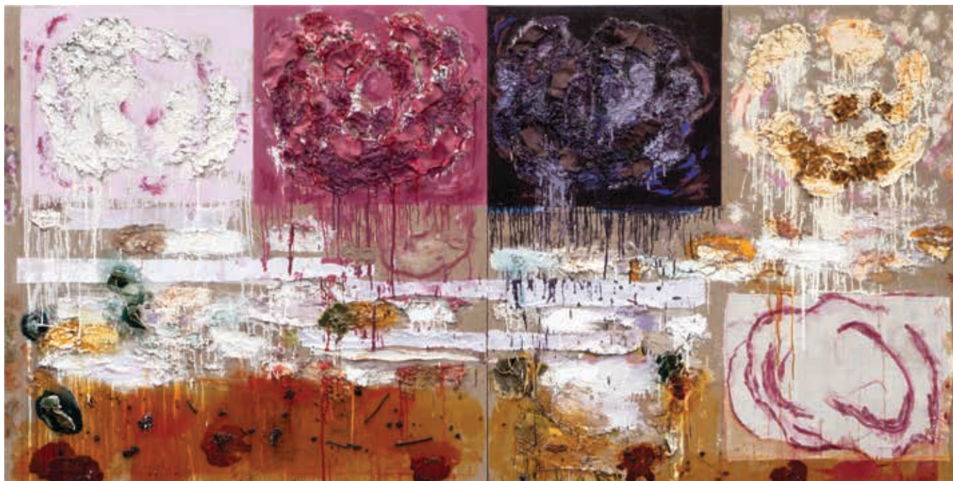
Symphony VII , 2014, oil, acrylic, papier-mâché, pastel, silk, berries, and dried sunflowers on linen, in two parts, 54 by 18.25 inches