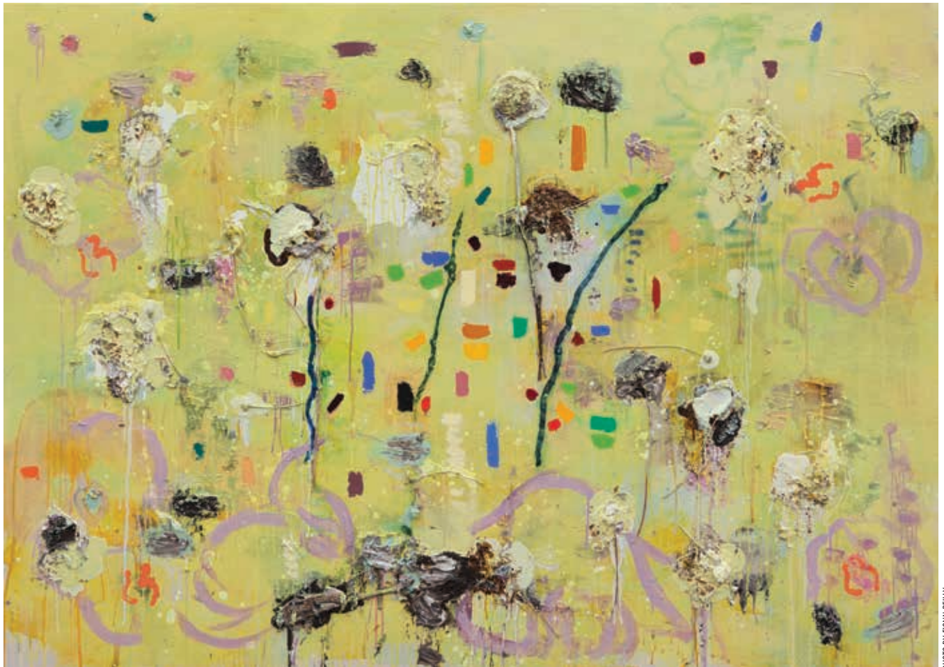
Lady , 2015, oil, acrylic, and dried flowers on canvas, 54 by 76 inches

I HAD THE GOOD fortune to visit with painter Joan Snyder in her Brooklyn studio in January. She greeted me in paint-splattered clothes as we made our introductions and continued into her living room, where some of her historic paintings, prints, and drawings sparkled. We then proceeded out the back door and through the backyard, past a small fishpond, and into her studio. A renovated carriage house held ample work space and various tables ordered with jars, bottles, tubes, cans, brushes, and other tools for art-making. Several skylights diffused cool light over a series of freshly painted canvases. The new pieces conveyed her signature iconography: luscious fields of color, heavy impasto contrasted by areas of bare canvas, gestural brushstrokes bleeding drips of paint, and embedded mixed media. Various combinations of glitter, silk, dried flowers, earth, burlap, and more were layered beneath a medley of acrylic paints, gel mediums, oil paint, and oil sticks, and spoke in chorus along the studio walls.